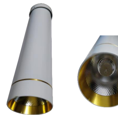
Cool White Neutral White Warm White

Indoor : Showrooms, Restaurants, Cafe, Reception