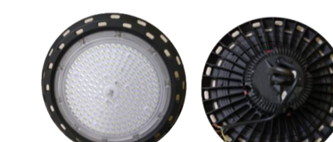
Cool White Neutral White Warm White

Indoor & Outdoor : Warehouses, Factories, Airports, Loading Areas Sheds, Food Courts/Mall, High Ceiling Areas