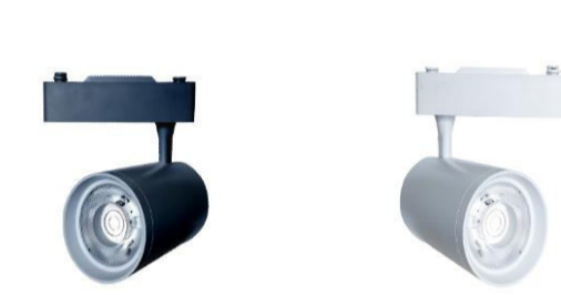
Cool White Neutral White Warm White