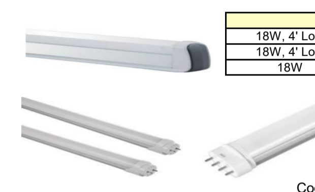
Cool White Neutral White Warm White

Indoor : Ideal replacement of standard tube