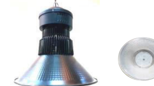
Cool White Neutral White Warm White

Indoor : Warehouses, Factories, Sheds, High Ceiling, Airports