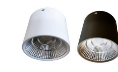
Cool White Neutral White Warm White

Indoor : Showrooms, Restaurants, Cafe, Reception