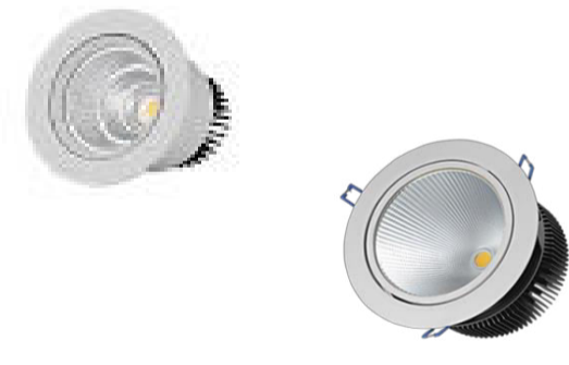
Cool White Neutral White Warm White

Indoor : Niches, Cabinets, Decorative, Offices Showrooms, Luxury Residences