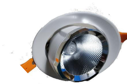
Cool White Neutral White Warm White