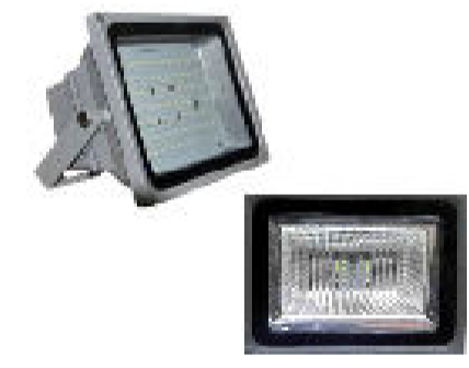
100W also available in PINK/RED/GREEN/BLUE Colors Cool White Neutral White Warm White

Outdoor : Grounds, Stadium, Parks, Construction