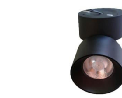
Cool White Neutral White Warm White

Indoor : Showrooms, Restaurants, Auditoriums