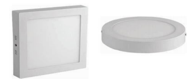
Cool White Neutral White Warm White

Indoor : For Ceiling, Staircase without conceal Outdoor : For Balcony, Sheds