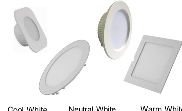
Cool White Neutral White Warm White

Indoor : Conceal Lights ideal for false ceilings