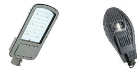
Cool White Neutral White Warm White

Outdoor : Ideal replacement for conventional street lights